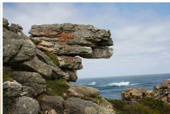
Cape of Good Hope